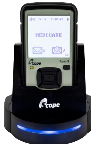
MED30 Epoc IP67 Rechargeable Pager

Pagers are used to alert staff while mobile around the site. It is ideal for alerting care staff while out of sight to a display panel.