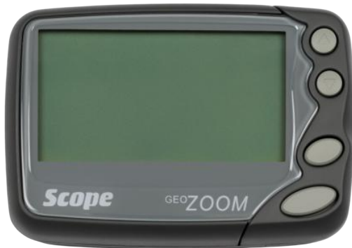
MED6 Holstered Pager

The Medicare pager app is a smart way to improve efficiency within your home; the alerting can be set to either an audible tone, speech, or silence within a quiet system.